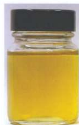
OTHER BRAND OIL